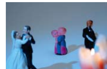
Fox in the Mirror VIDEO - 20 MINUTOS (SOM / COR)