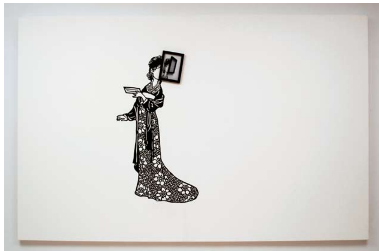
To Be There 2001 ACRÍLICA SOBRE TELA E IMPRESSÃO DIGITAL EMOLDURADA 152,5 x 246,5 CM