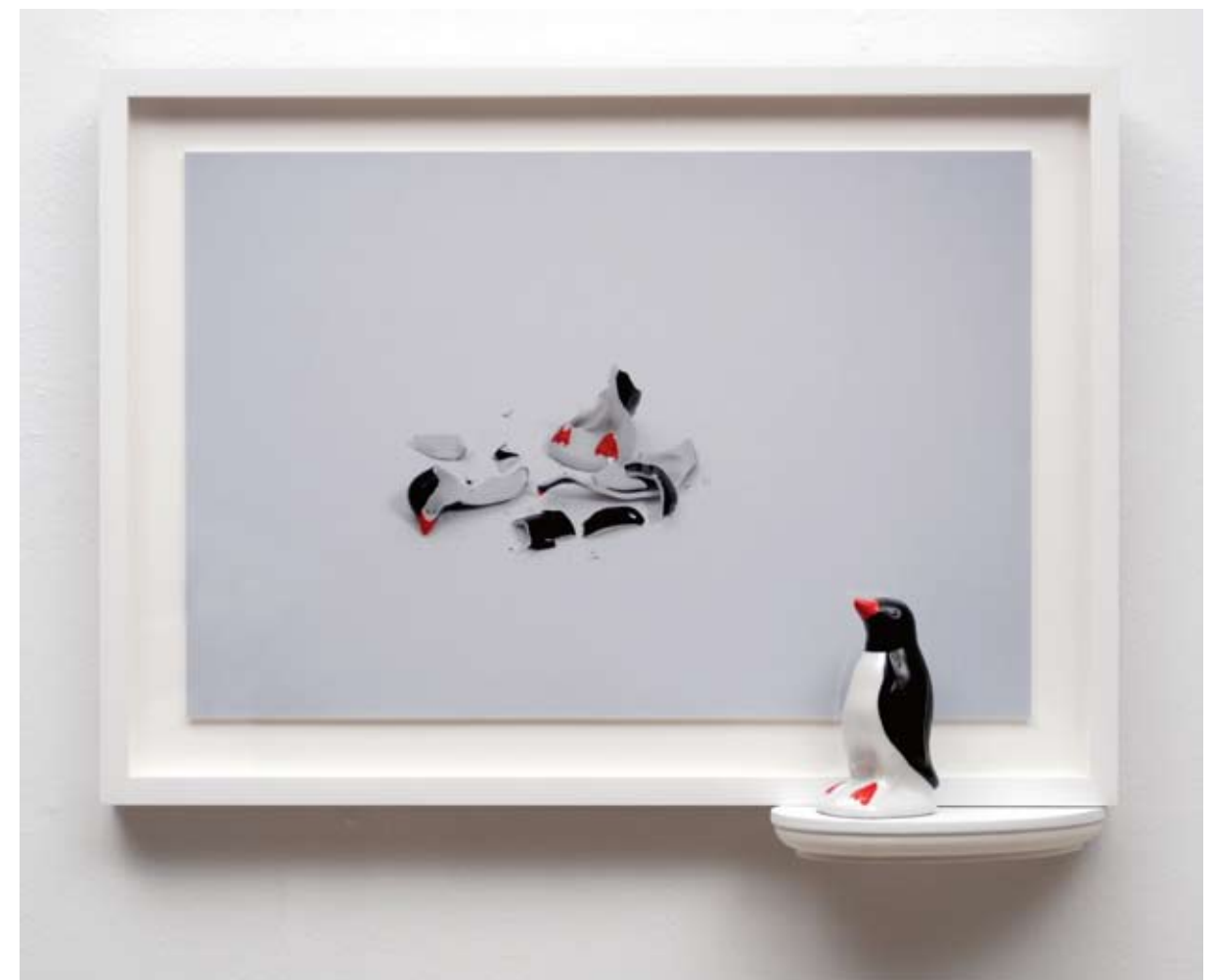
Reconstruction 2008 IMPRESSÃO DIGITAL EMOLDURADA, PRATELEIRA DE MADEIRA PINTADA E PINGÜIM DE PORCELANA 38 x 39,3 x 11,5 CM