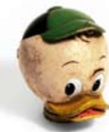
Green Hat 2007 FOTOGRAFIA EM DURAFLEX 48,5 x 37,5 CM