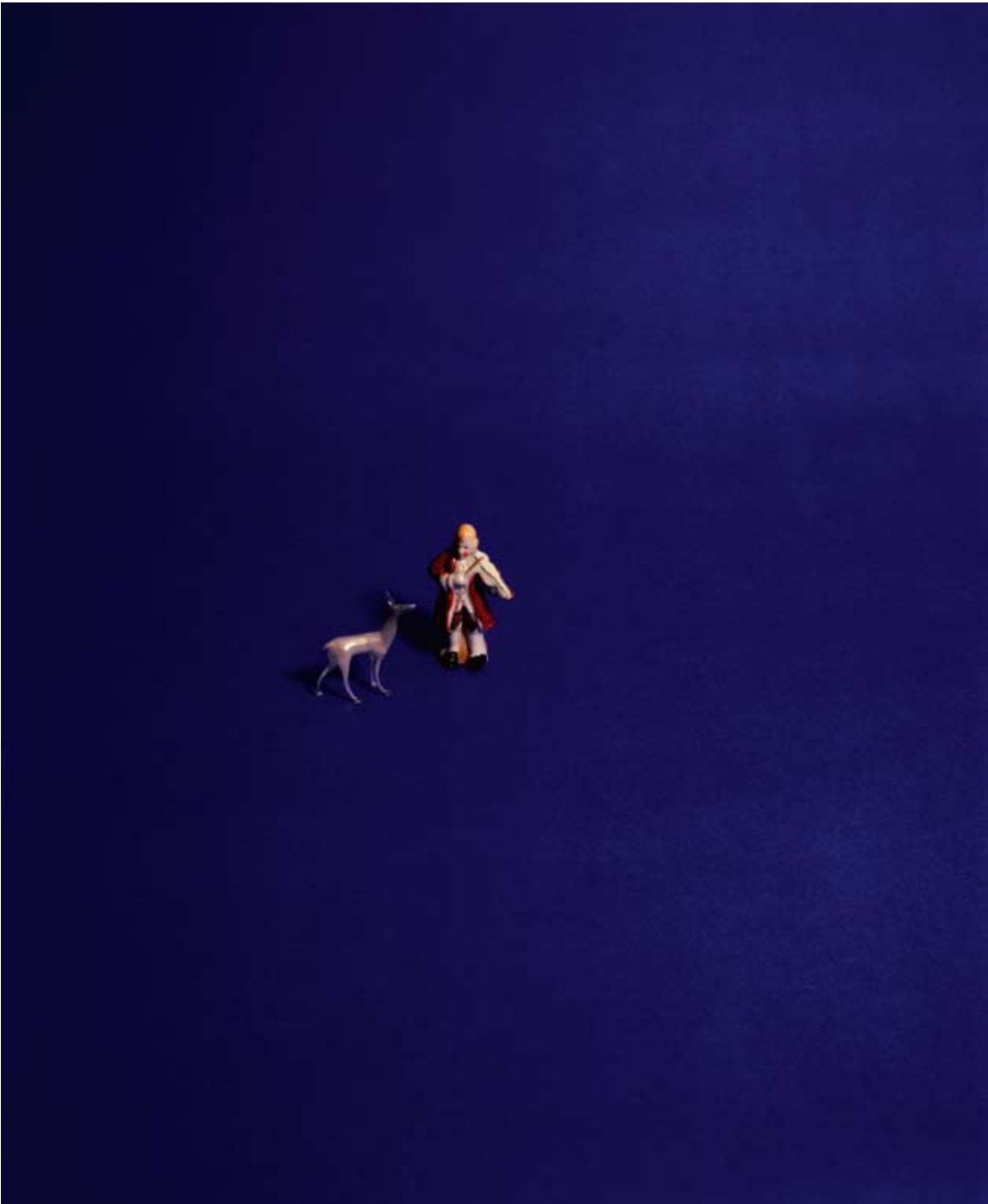
Deer - Violinist 2007