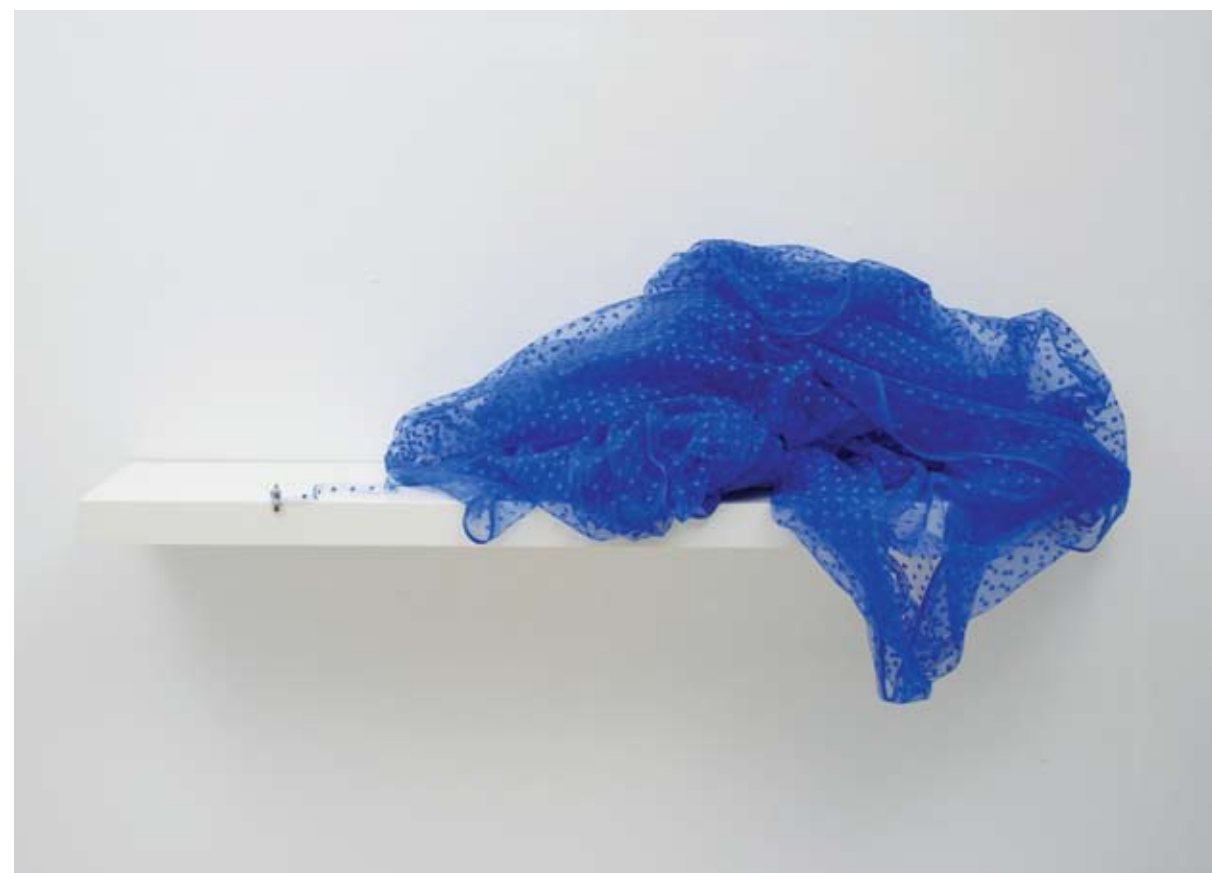
Forced Labor (Weaver-Blue) 2008 ESTATUETA DE METAL, TECIDO E PRATELEIRA DE MADEIRA PINTADA MEDIDAS VARIÁVEIS / MEDIDA BASE 110,3 x 25,5 x 5 CM