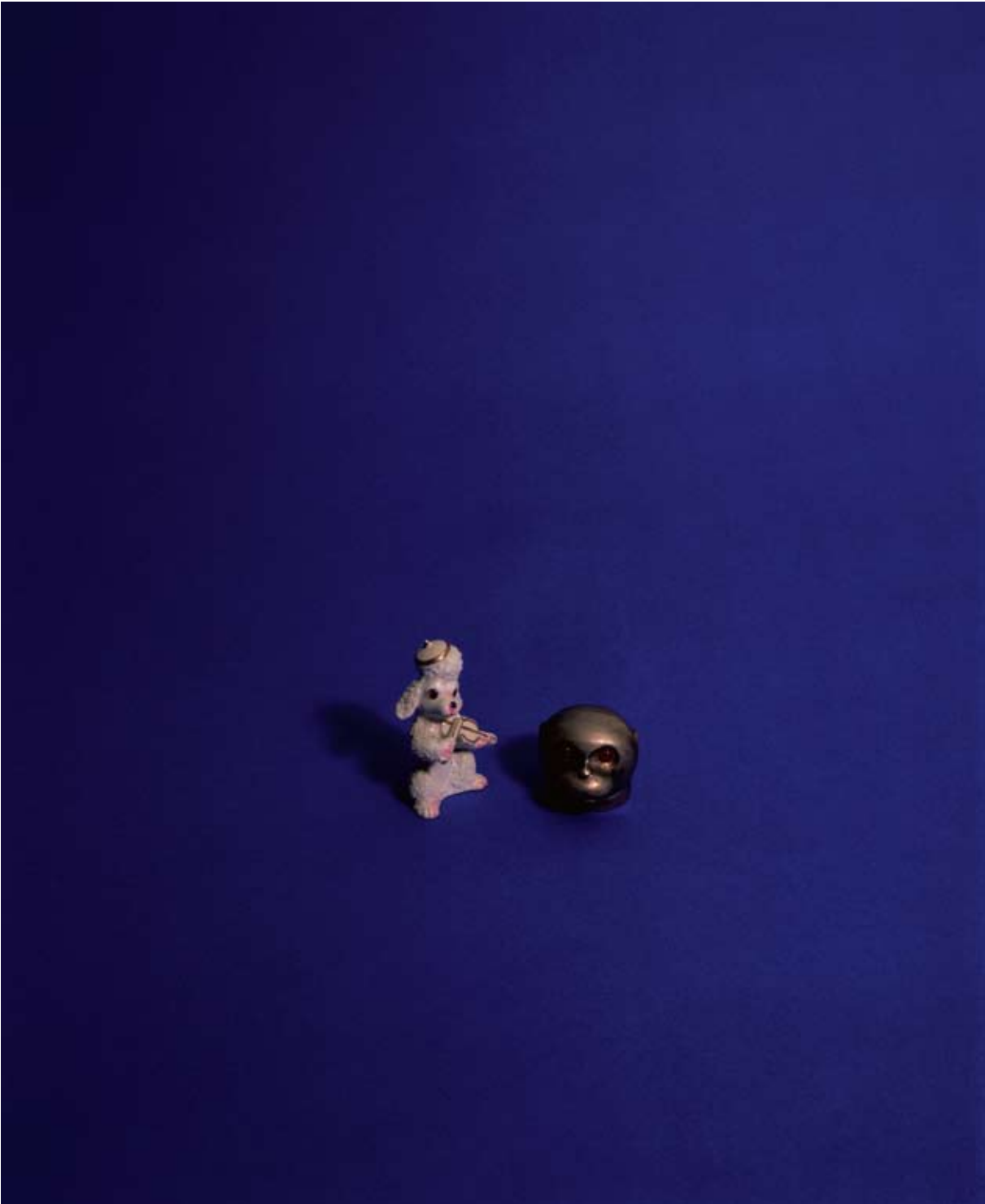
Violinist - Monkey 2007 FOTOGRAFIA EM DURAFLEX 84 x 66 CM