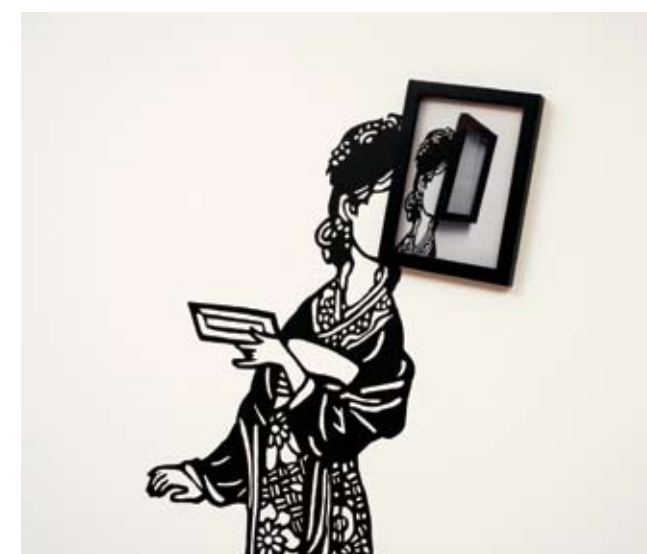
To Be There 2001 DETALHE DETAIL