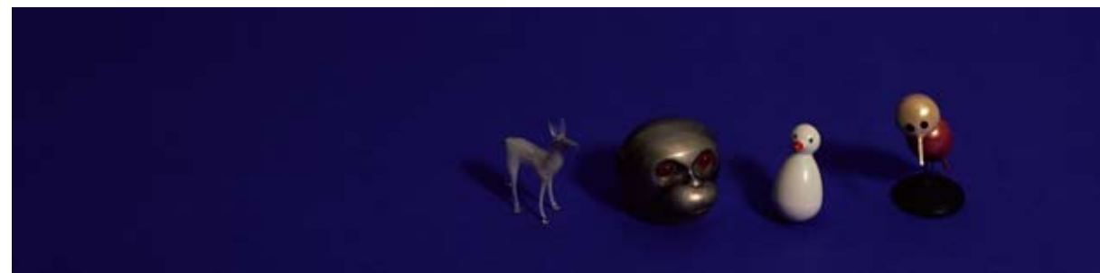
Deer and Others 2007 FOTOGRAFIA EM DURAFLEX 18 x 71,6 CM