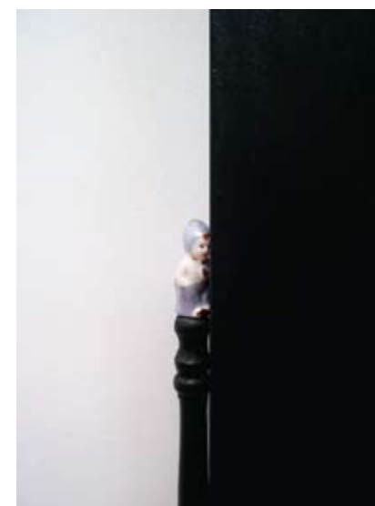
To Hide 2001 DETALHE DETAIL