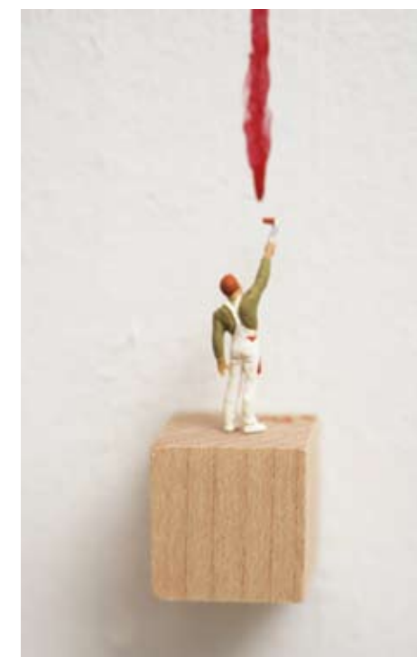
Forced Labor (Weaver-Blue) 2008

BASE DE MADEIRA, ESTATUETA DE METAL E PINTURA SOBRE A PAREDE MEDIDAS VARIÁVEIS / MEDIDA DO OBJETO 9 X 5 X 5 CM