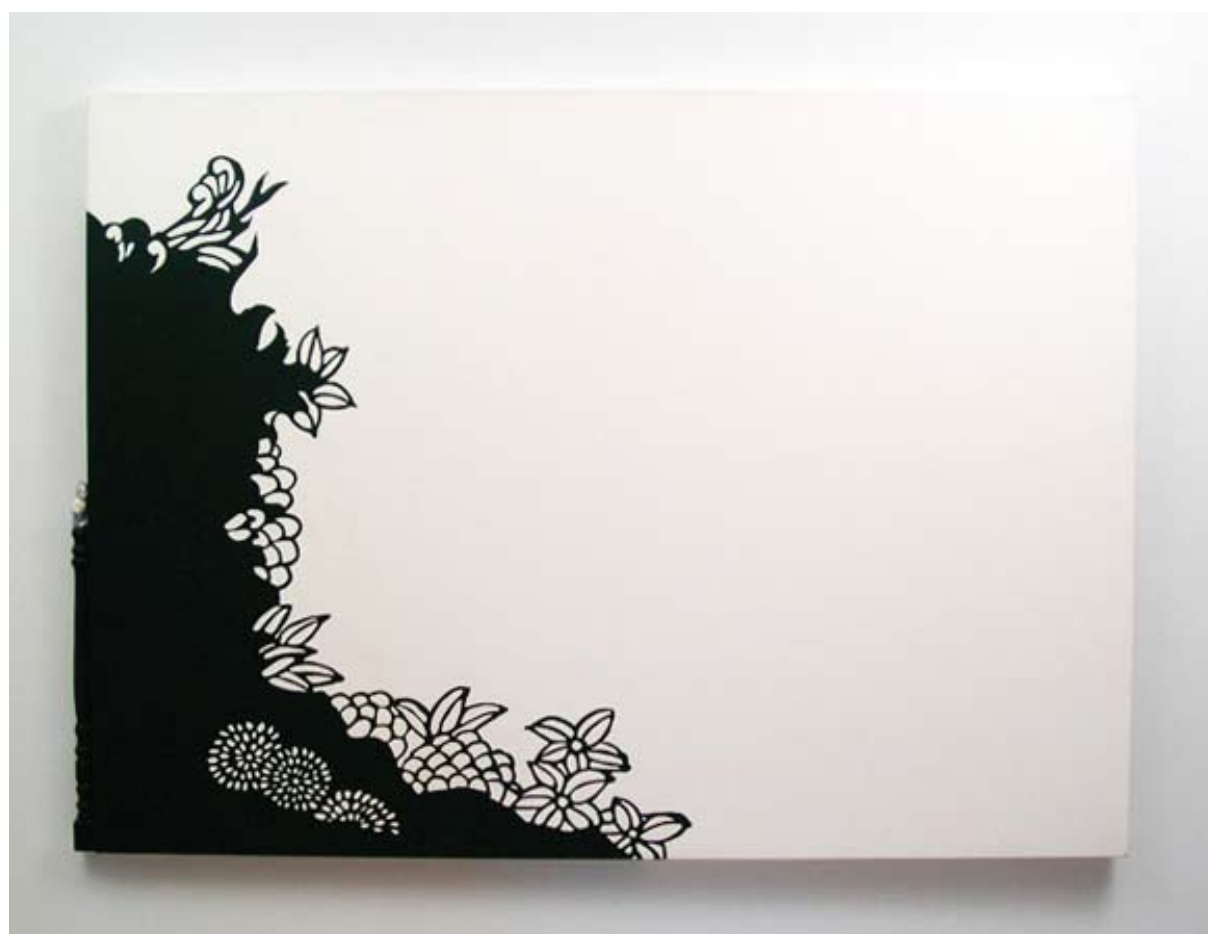
To Hide 2001 ACRÍLICA E ASSEMBLAGE SOBRE TELA E ESTATUETA DE PORCELANA 112 x 157,5 x 5 CM