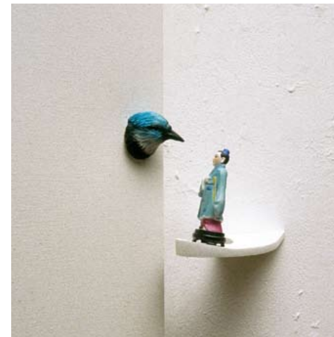
Dialogue Limit 1998 DETALHE DETAIL