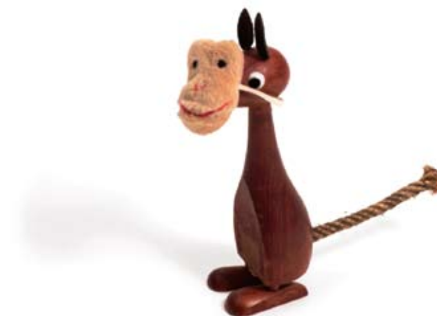
Disguise (with Monkey Mask) 2007 FOTOGRAFIA EM DURAFLEX 46 x 35,5 CM