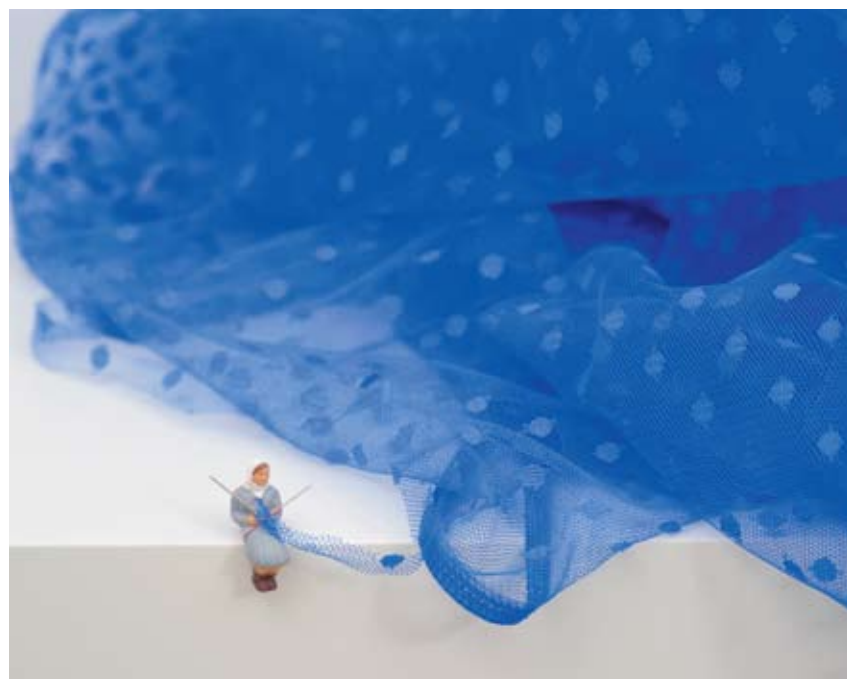
Forced Labor (Weaver-Blue) 2008 DETALHE DETAIL