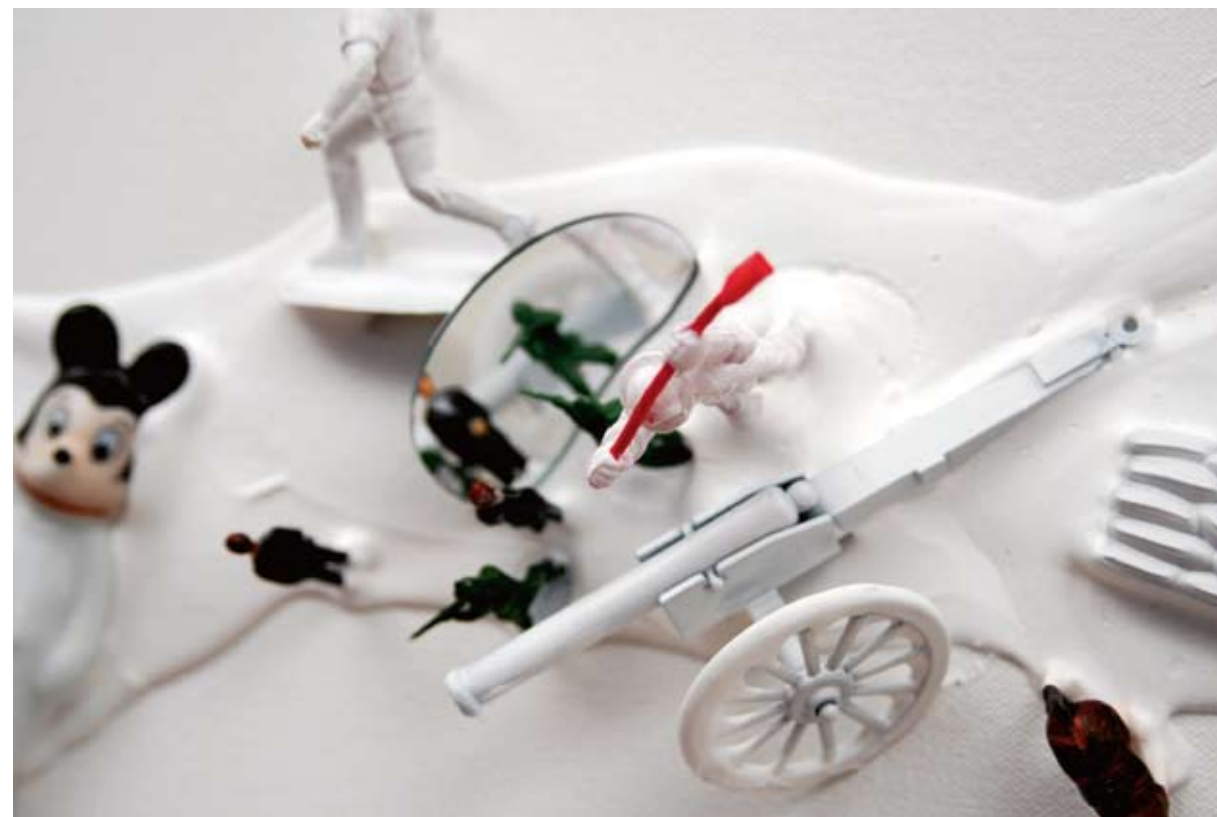
To See White 2008 DETALHE DETAIL