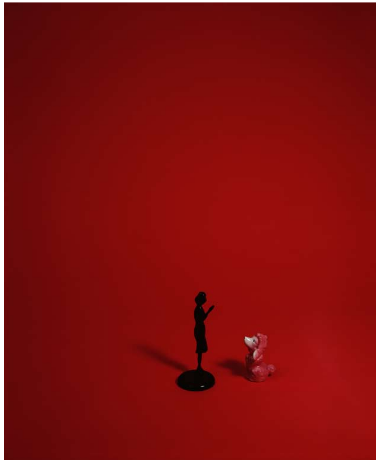
The Lecture 2008 FOTOGRAFIA EM DURAFLEX 101,5 x 76 CM