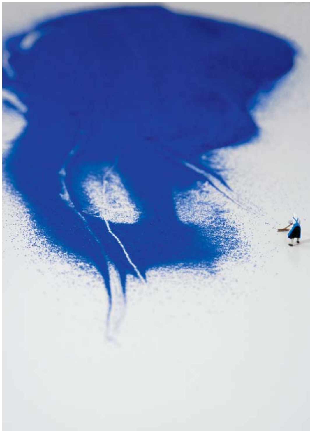
Forced Labor (Blue Sand) 2008 DETALHE DETAIL