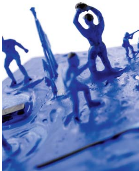
To See Blue IV 2008 DETALHE DETAIL