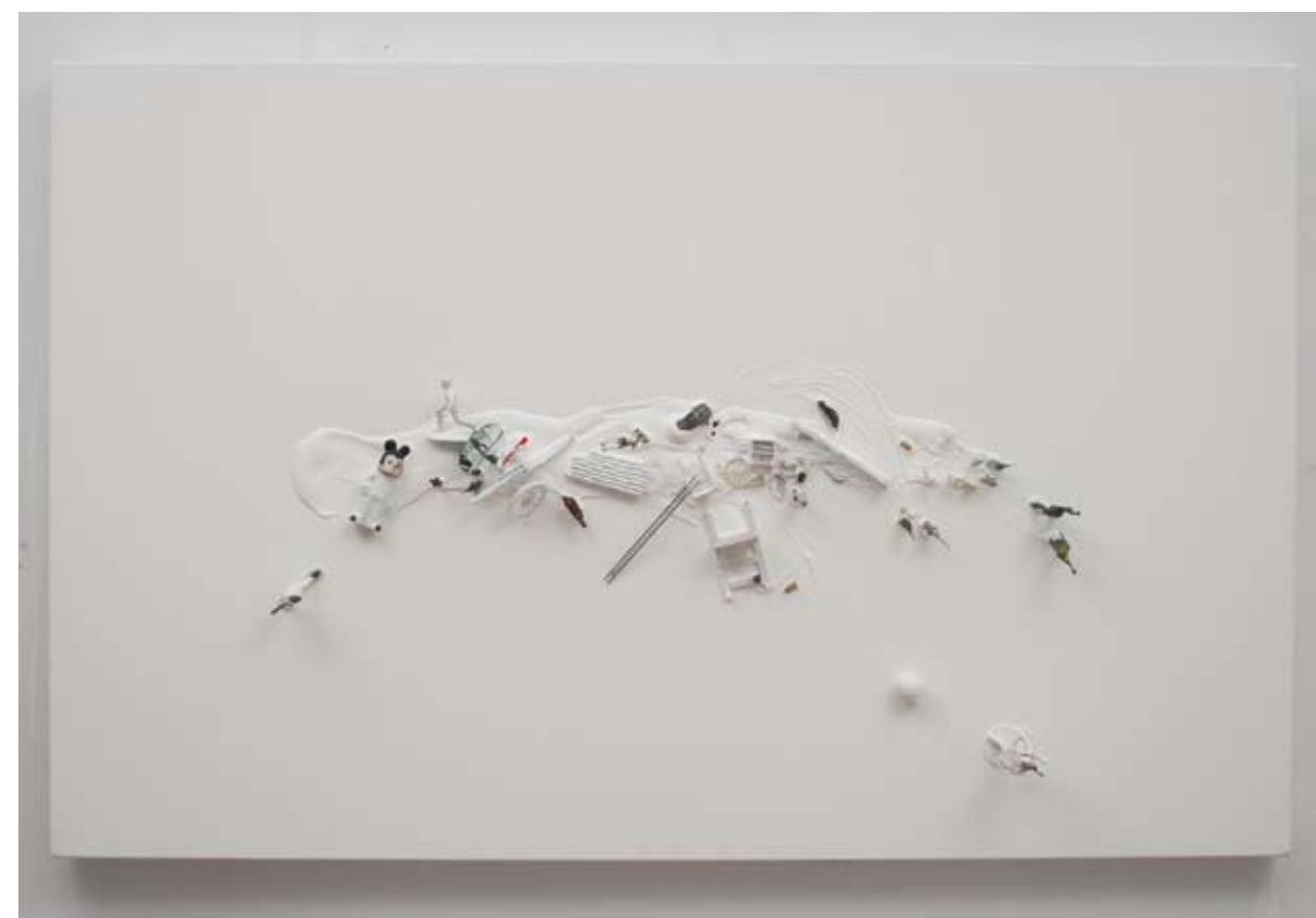
To See White 2008 ACRÍLICA E ASSEMBLAGE SOBRE TELA 71 x 112 x 12,5 CM