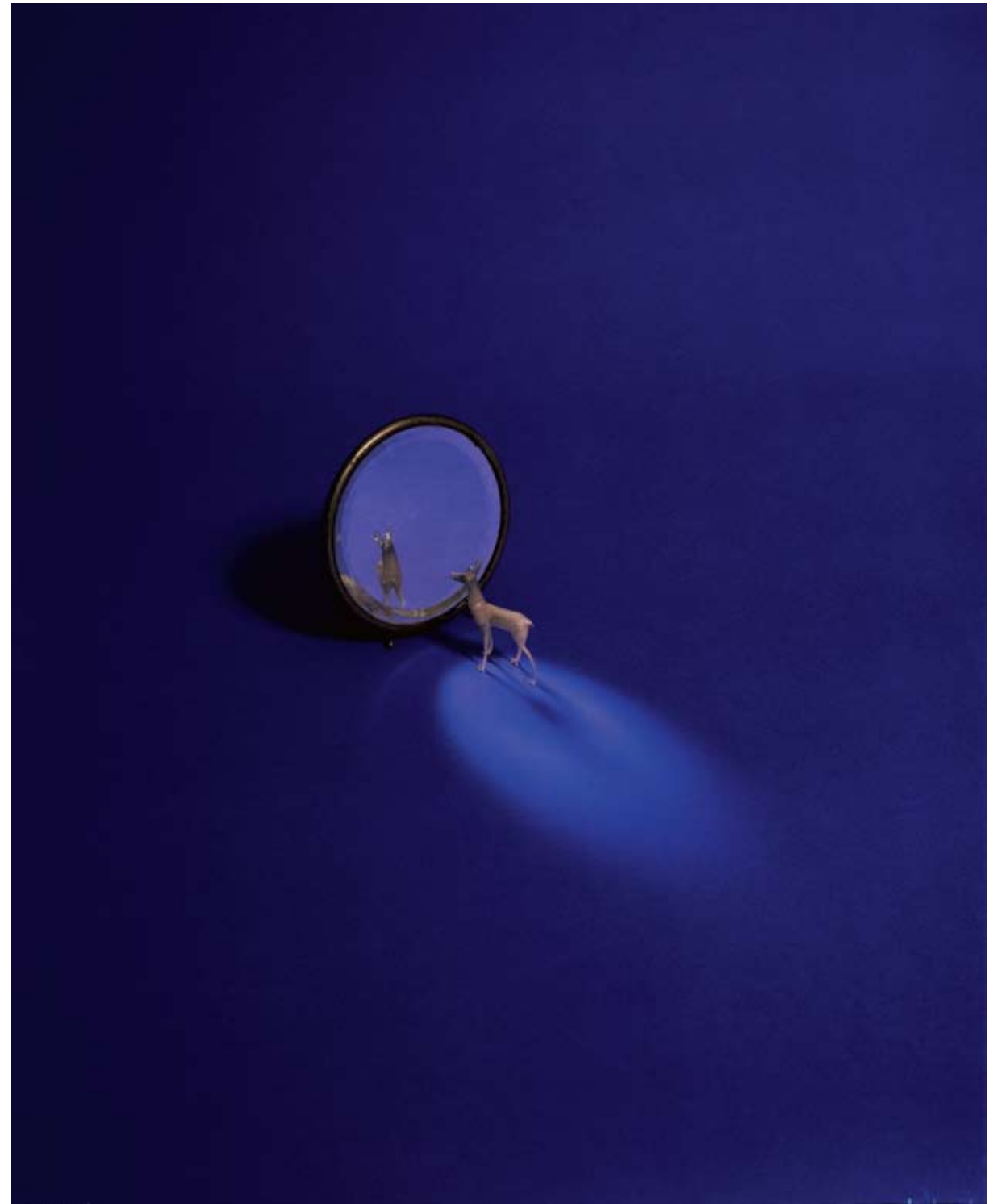
Deer with Mirror 2007 FOTOGRAFIA EM DURAFLEX 85,3 x 63,5 CM