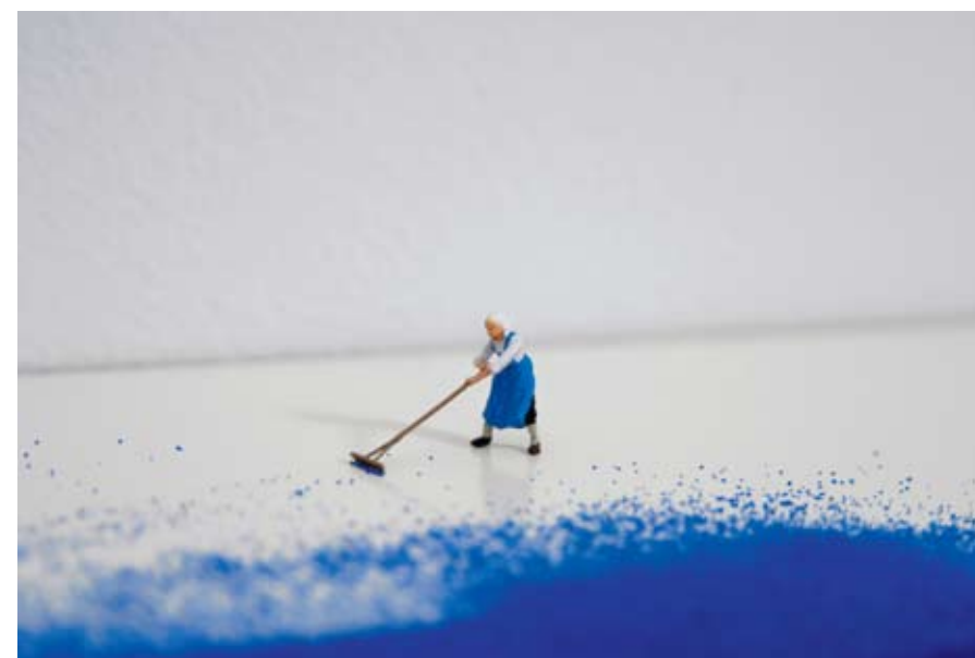
Forced Labor (Blue Sand) 2008 DETALHE DETAIL