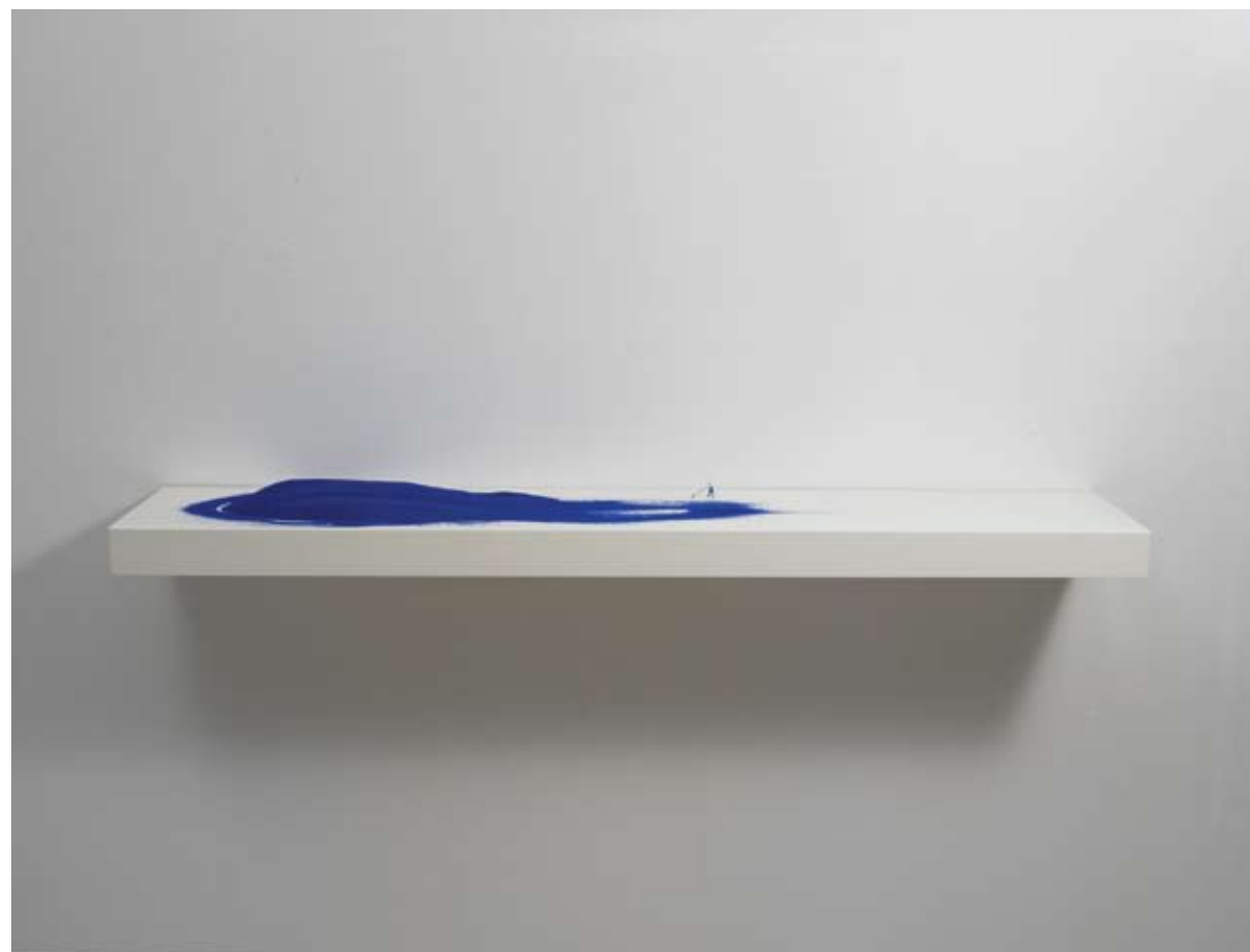
Forced Labor (Blue Sand) 2008 ESTATUETA DE METAL, AREIA AZUL E PRATELEIRA DE MADEIRA PINTADA 9 x 110,5 x 26,1 CM