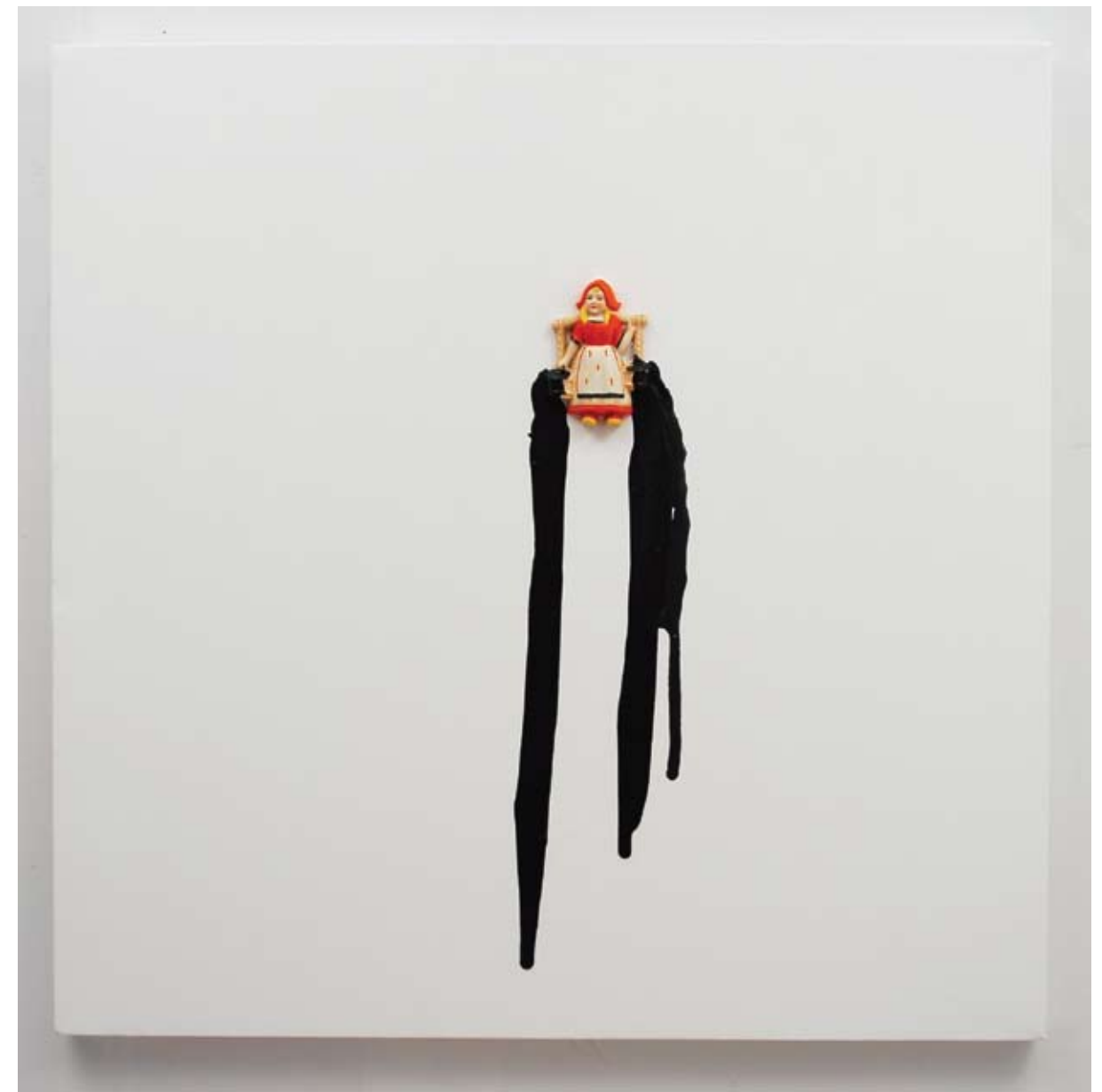
Untitled (with Black Drips) 2008 ACRÍLICA E ASSEMBLAGE SOBRE TELA 91,5 X 91,5 CM