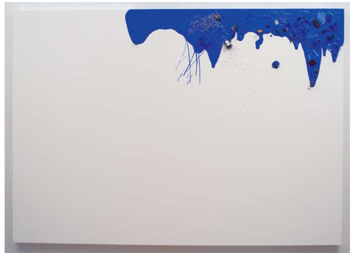
To See Blue IV 2008 ACRÍLICA E ASSEMBLAGE SOBRE TELA 112 X 157,5 X 10 CM