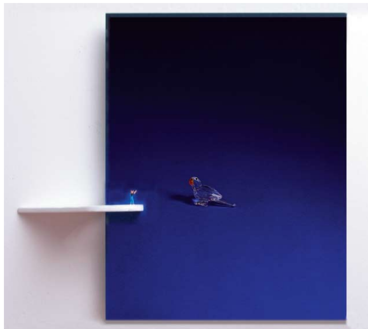
Situation with Glass Bird 2005

FOTOGRAFIA EM DURAFLEX, PRATELEIRA DE MADEIRA PINTADA E ESTATUETA DE METAL 46 x 48,5 x 7,5 CM